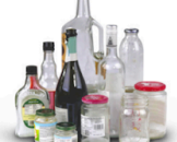
Botellas y frascos vaciar y enjuagar