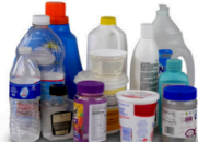
Botellas, frascos, jarras y tarrinas vaciar y reemplazar la tapa