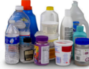
Bottles, Jars, Jugs and Tubs empty and replace cap