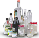
Bottles and Jars empty and rinse